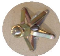
Five Way Expansion

An all metal cavity, expanding cavity fixing suitable for use in plasterboard and any other cavity application. With 5 expanding legs the Hollow Wall Anchor provides the maximum bearing area to withstand lateral and shear loads